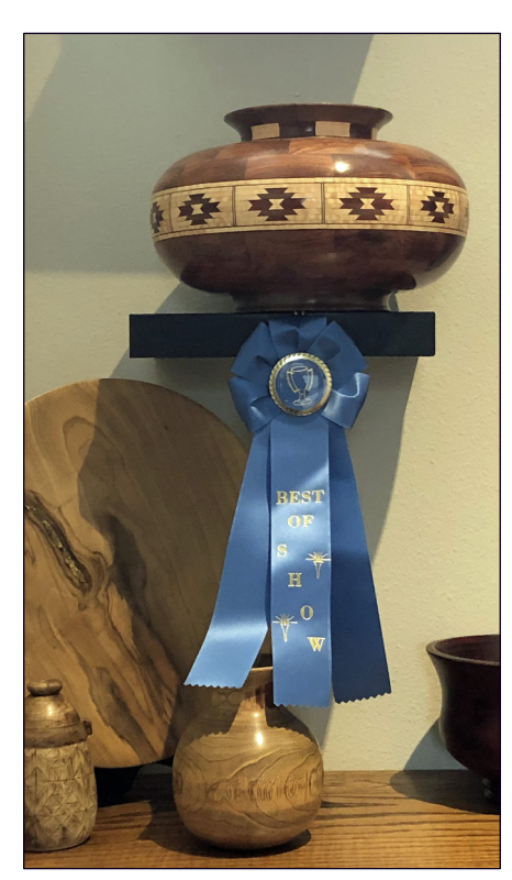
This beautiful pot earned Dick Easter a blue ribbon at an art show in Hot Springs.

In 1996, he and some other men formed the Village